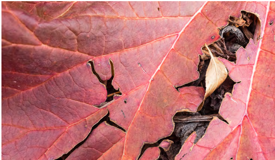
Reds and pinks abound in the garden from spring through autumn, accented by giant rhubarb leaves.