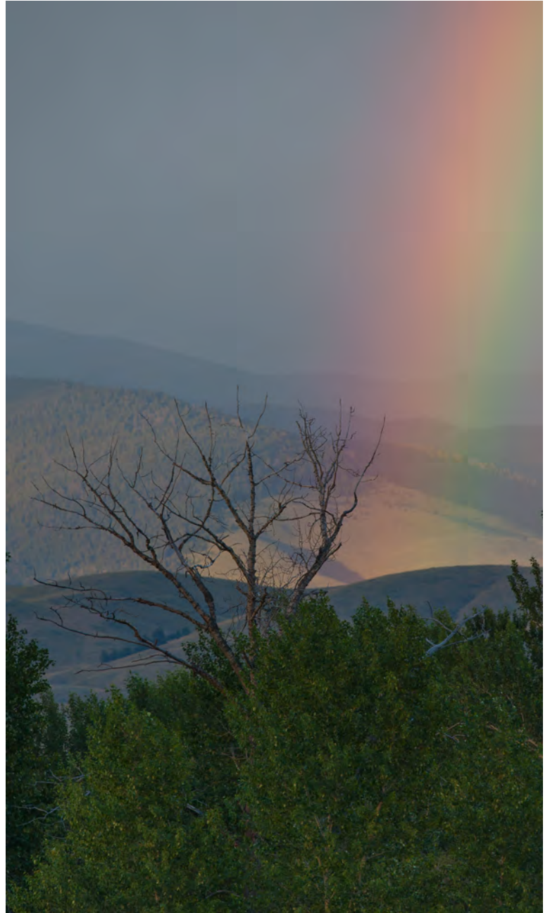
The sky takes on color after storms pass through Eastern Idaho.