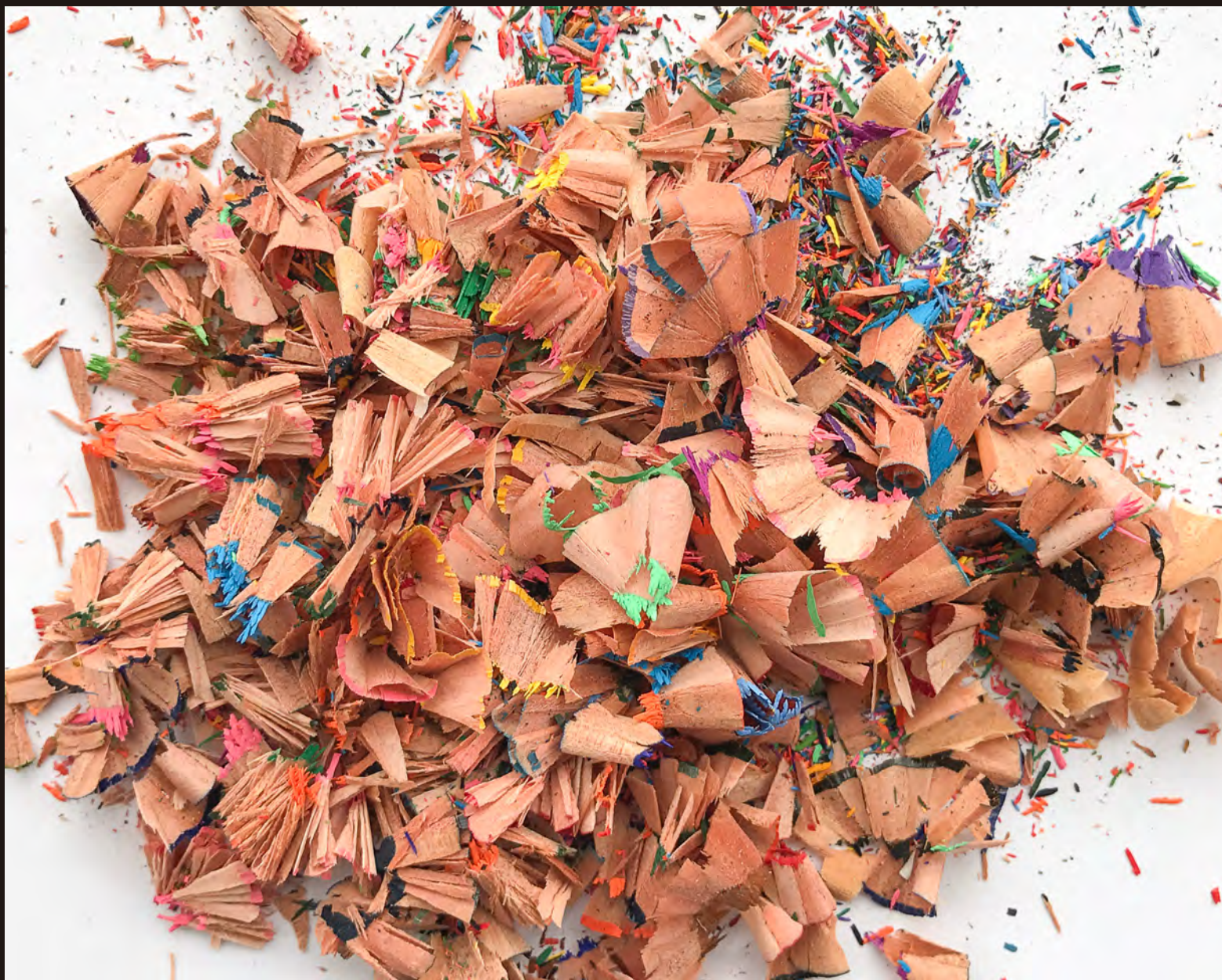
Coloring books, which have become popular again with adults, yield a wealth of pencil shavings. Left, a Mother's Day rose retains its beauty long after the holiday.