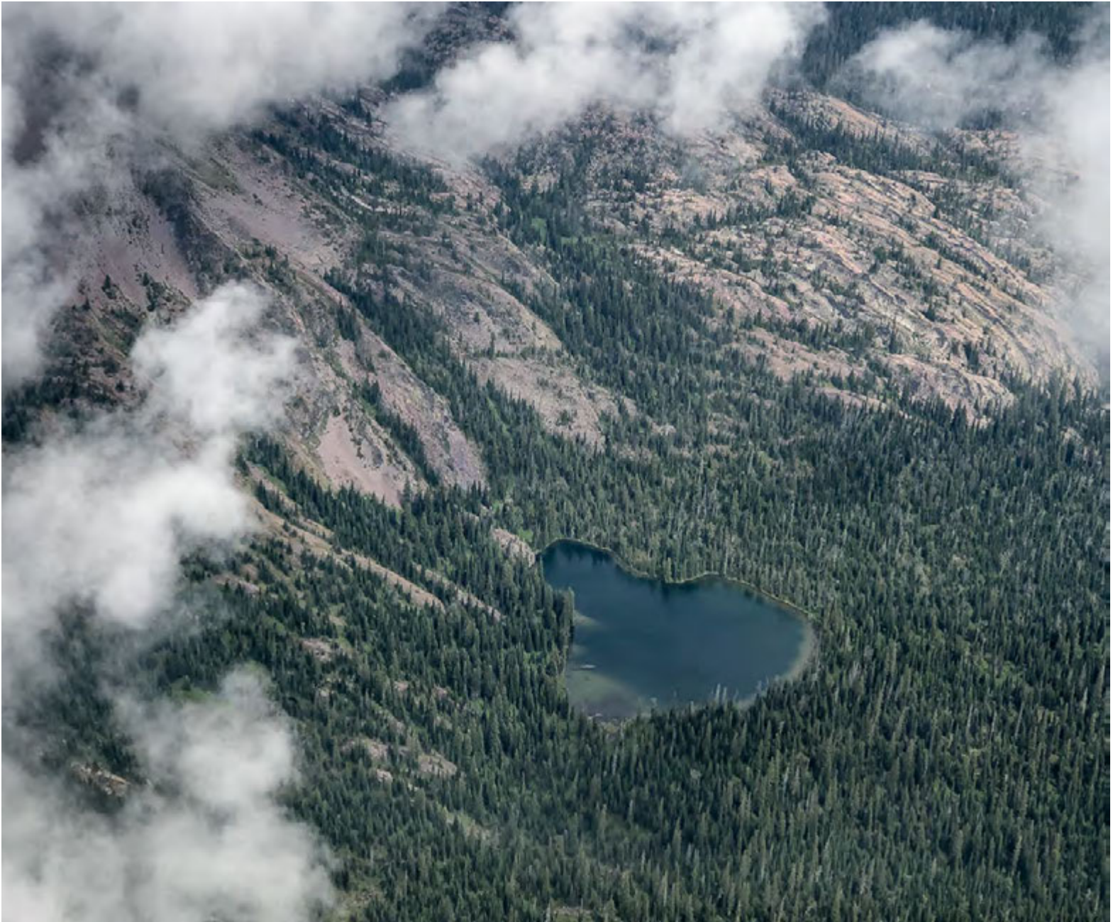
A heart-shaped lake is seen on approach to Missoula International Airport.