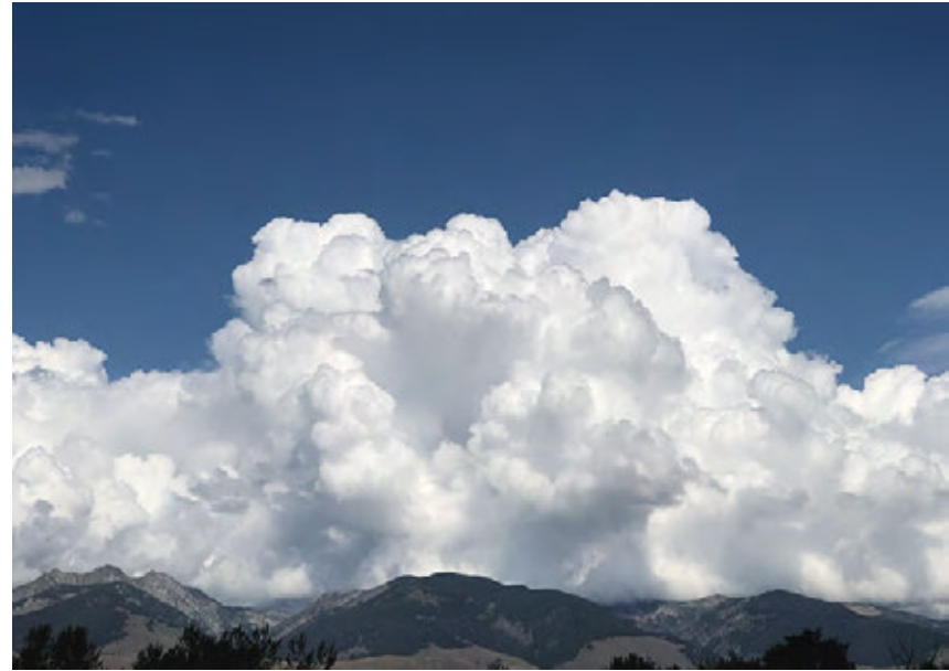
August's wild weather had raindrops plastered to the window following an intense storm, left. Above, clouds tower over the Beaverhead Mountains.