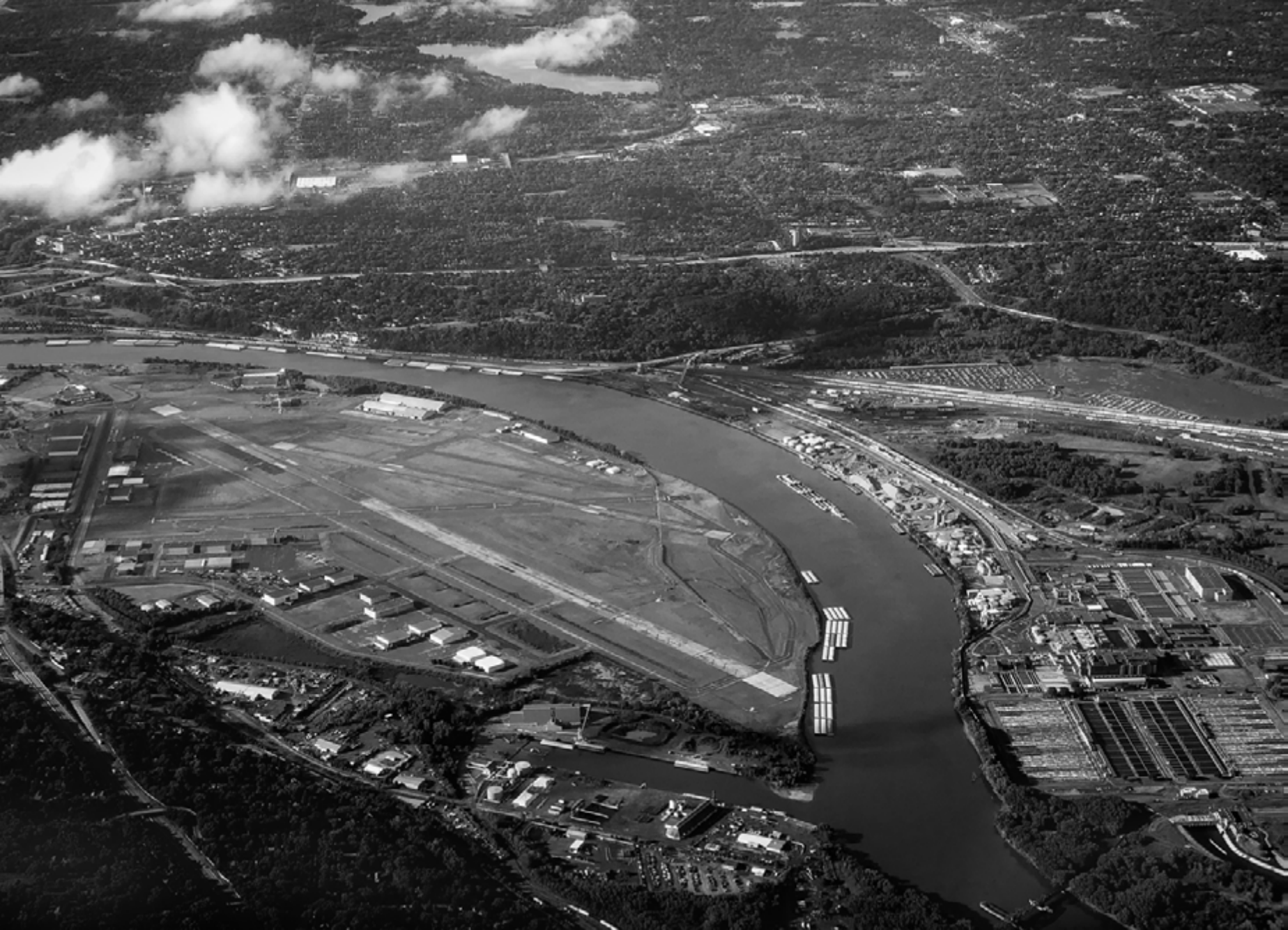
The Pillsbury "A" Mill, once the largest in the world according to the Minneapolis Historical Society, stands near the Mississippi River in Minneapolis. Pillsbury was sold to General Mills and the building converted to artist lofts. The riverfront pays homage to the city's industrial past. Above, barges line the Mississippi River near Holman Field (St. Paul Downtown Airport).