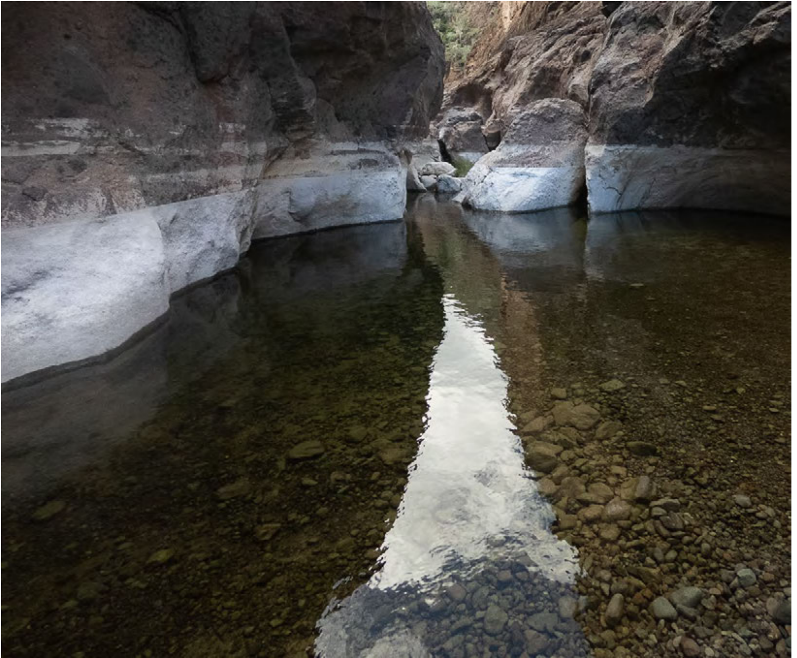
An oasis is a surprise in the Loreto desert during an ATV ride.