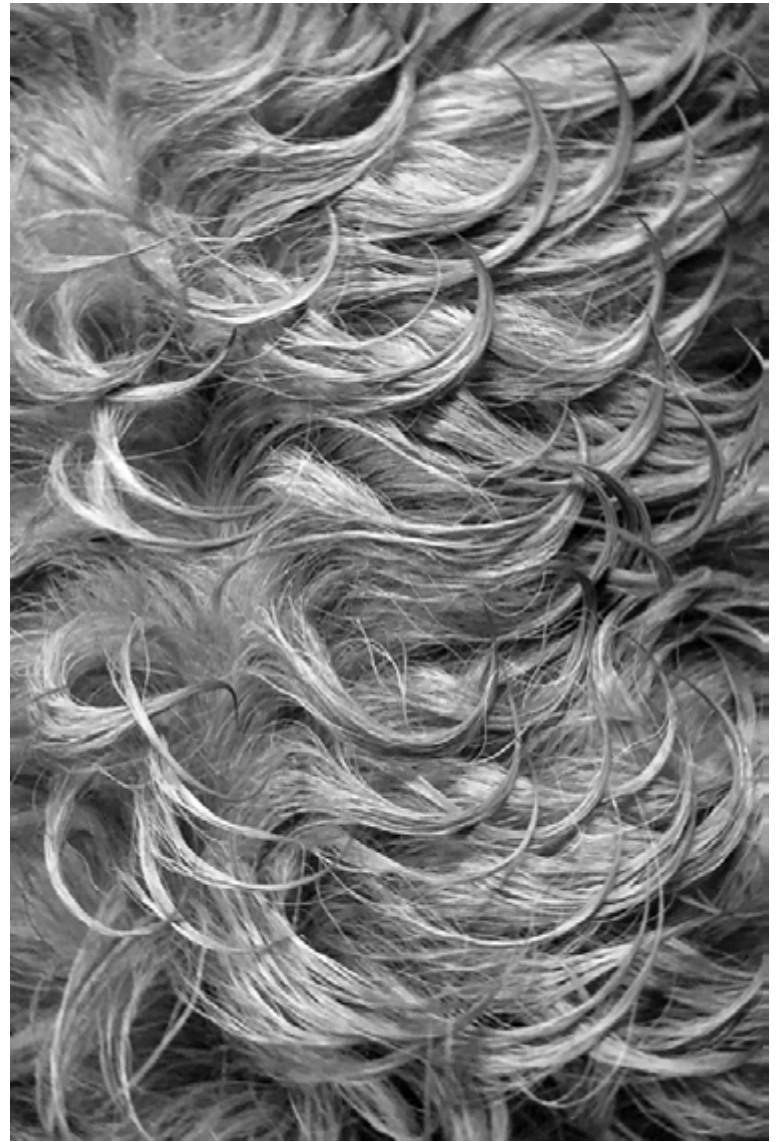
Bubble wrap, plentiful around the house during packing, and Freyja's curly, wet hair inspire studies in texture.