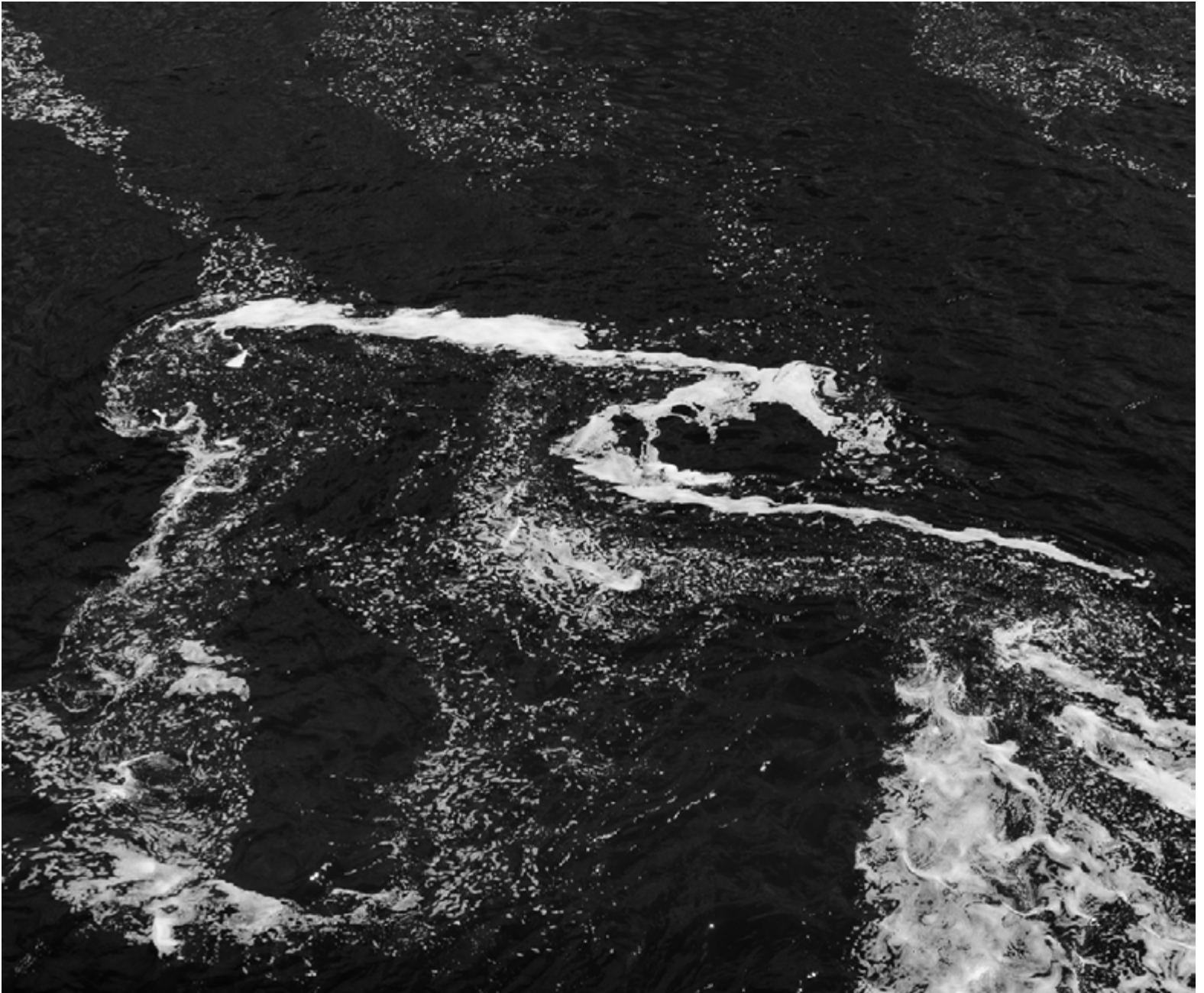
Water swirls beneath the Stone Arch Bridge in Minneapolis.