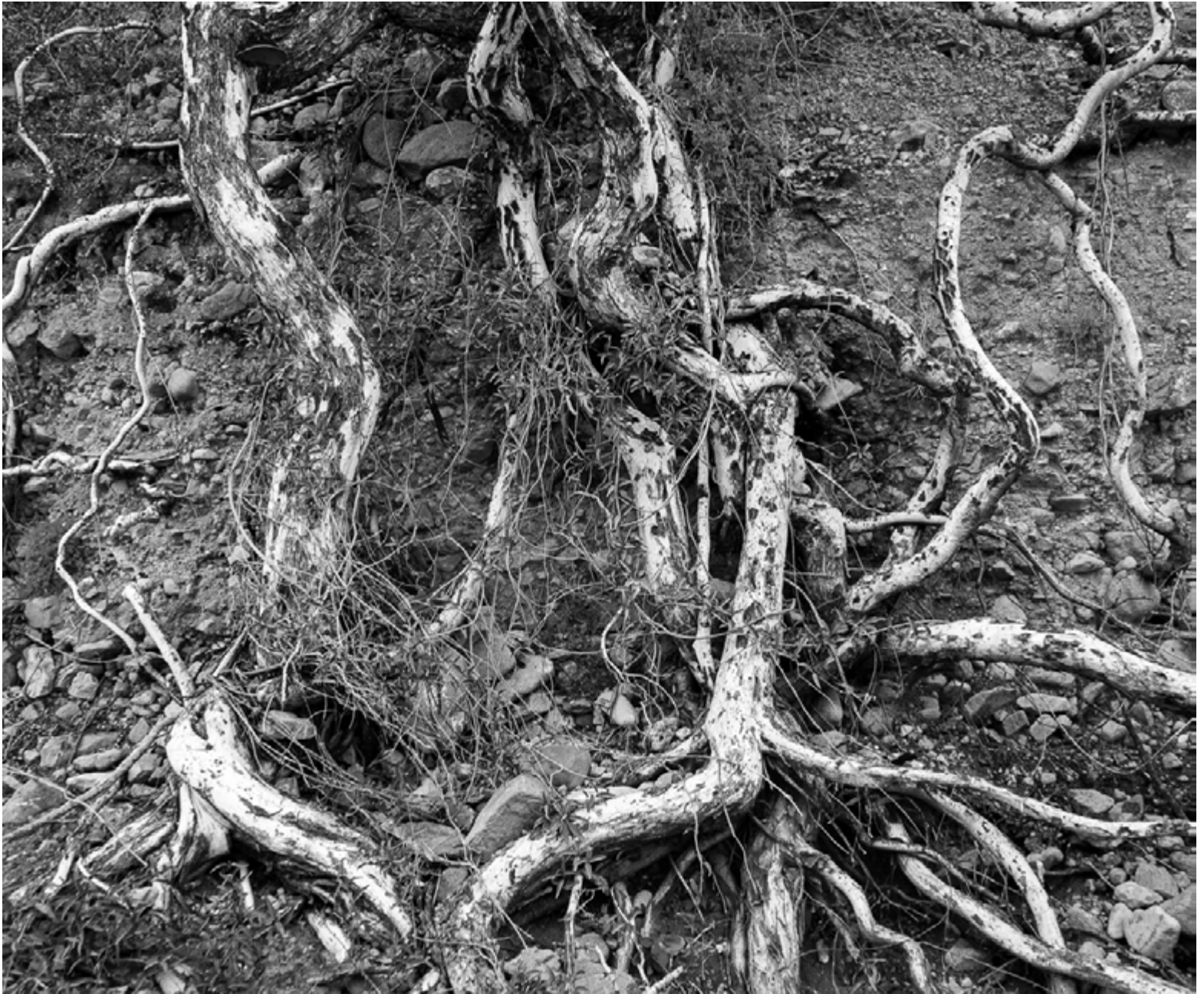
Gnarled cliffside tree roots are exposed to the air in Baja California Sur.