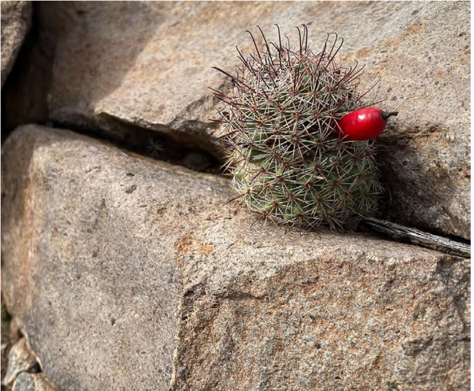
A little old man cactus finds a home among boulders in Baja California Sur.