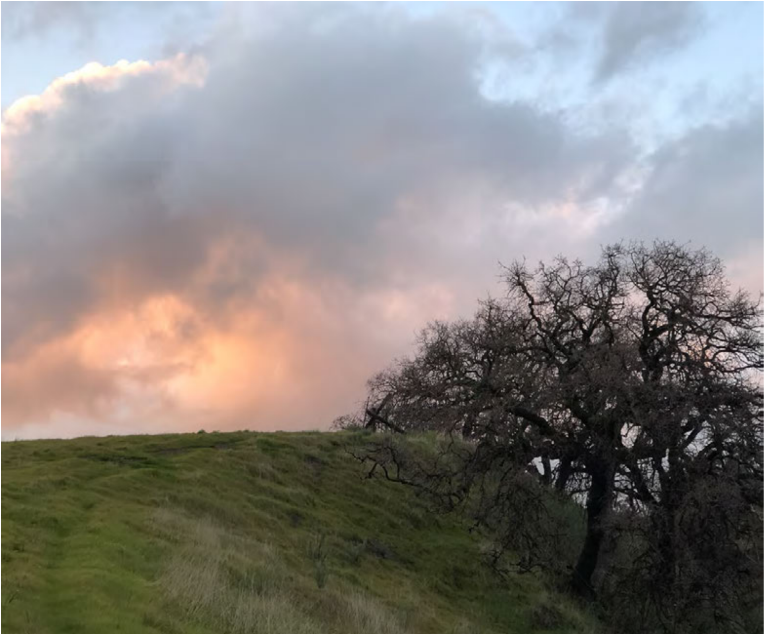
An oak tree hangs onto to the steep slope of Arroyo Seco in Livermore.