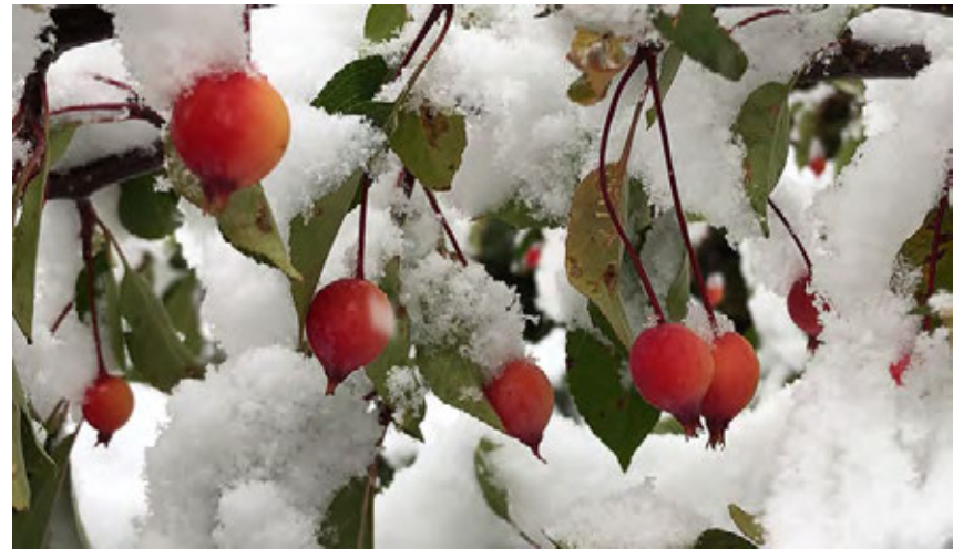
Snow arrived in September, covering the crabapples.

Previous pages: The unpaved Lemhi Pass road takes travelers between Idaho and Montana. Next pages: Tall grass bends to the snow, but does not break.